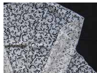
Laces, XVII century Museum collection