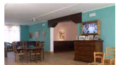
Burano Lace Museum Exhibition rooms, first floor