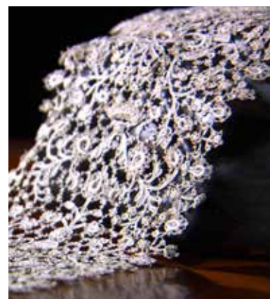
Lace, XVII century Museum collection