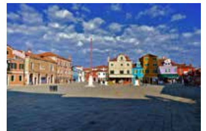
Lace, Museum, Piazza Galuppi, Burano