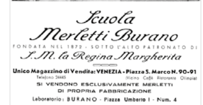
The Burano Lace School 1930s advertising poster