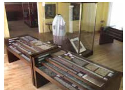
Burano Lace Museum First floor, Room 2