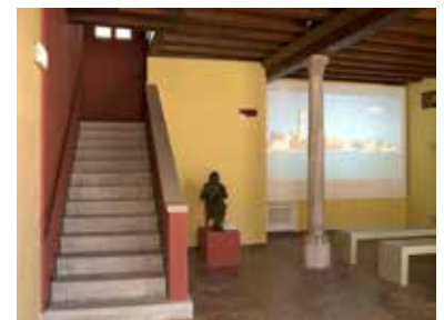
Burano Lace Museum Groundfloor