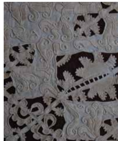
Lace, XVI century Museum collection

In the past, threads of superfine linen, but also of silk, gold and silver, were employed, while since the 20th century, cotton in particular. The main characteristic of needlepoint lace is its consistency, and in bobbin lace its lightness.