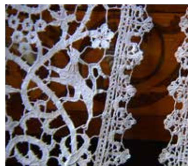
Lace, XVII century Museum collection