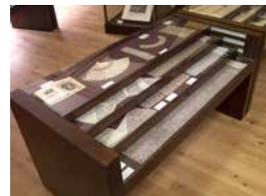
Museo del Merletto di Burano First floor, Room 2

The dramatic events of the American and French revolutions would lead to abandoning lace, considered as the odious symbol of a vanquished aristocracy. Decorative motifs followed those proposed by clothing fabrics: in the first half, luxuriant and mingling rocaille or shell elements, in the second, “meanders” with peach blossom and roses and in the last quarter their significant lightening and trivialisation.