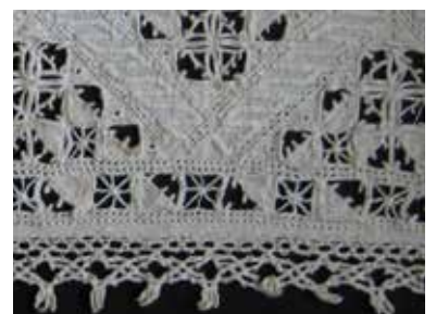
Lace, XVI century Museum collection