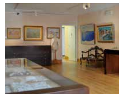
Burano Lace Museum First floor, Room 4