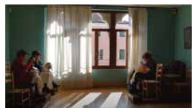
Burano Lace Museum First floor, Room 3