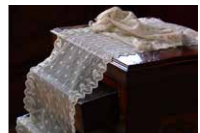
Lace, XVII century Museum collection