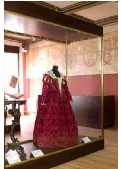
Burano Lace Museum First floor, Room 1